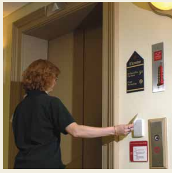
Pro-Watch assigns one credential to each user to provide a seamless integration of disparate systems.

"Video doesn't lie. If you take video into a courtroom, and use it as a piece of evidence, nine times out of ten, your prosecution is going to go very well for you," adds Hunt.