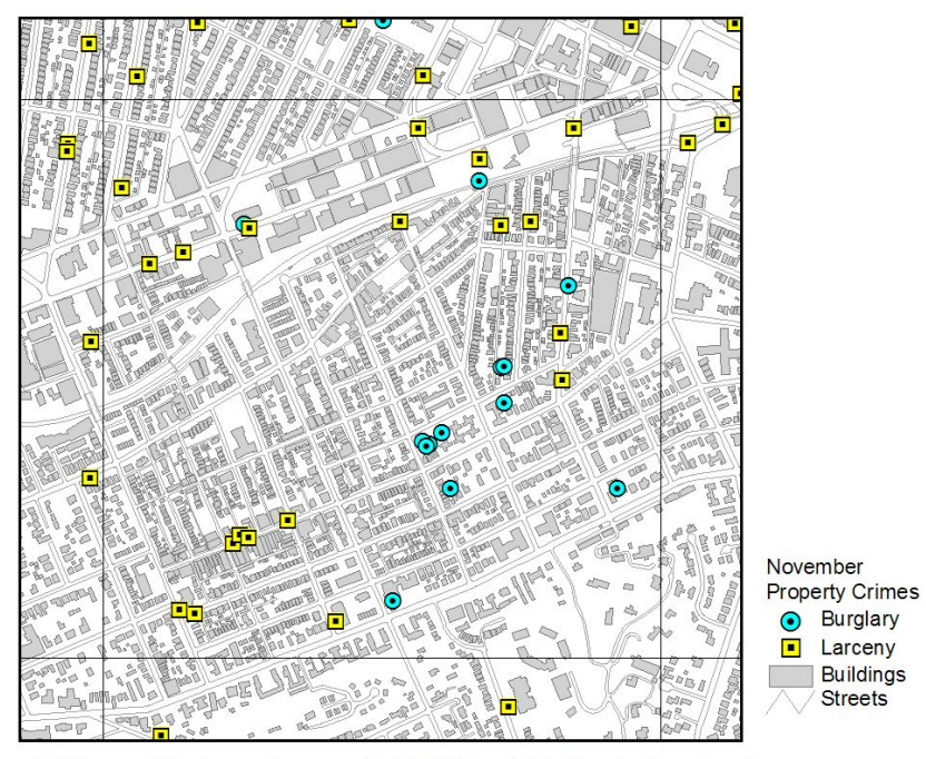
Buildings and Streets map layers provided by Pittsburgh City Planning Department

Figure 2: Zoom-In to Grid Cell 77 to View November Crime Points.